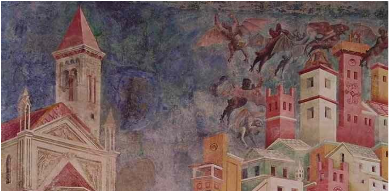
Legend of St. Francis fresco cycle --Upper Church, San Francesco, Assisi (particular)

ASSISI (Italy) – Palazzo dei Priori 20-21 February 2014